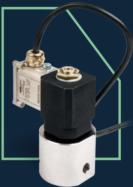
HyValve 1000, Type 3105

We aim to be your partner in building a hydrogen economy. For your peace of mind, our hydrogen valves were honed for long maintenance periods and easy serviceability. Our HyValve range will convince you by its high repeatability, utmost safety and exceptional reliability.