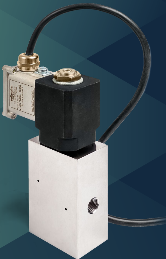
HyValve 1000, Type 3106

We aim to be your partner in building a hydrogen economy. For your peace of mind, our hydrogen valves were honed for long maintenance periods and easy serviceability. Our HyValve range will convince you by its high repeatability, utmost safety and exceptional reliability.