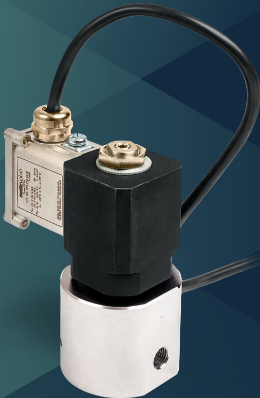
HyValve 1000, Type 3105

We aim to be your partner in building a hydrogen economy. For your peace of mind, our hydrogen valves were honed for long maintenance periods and easy serviceability. Our HyValve range will convince you by its high repeatability, utmost safety and exceptional reliability.